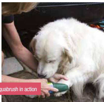
Aquabrush in action